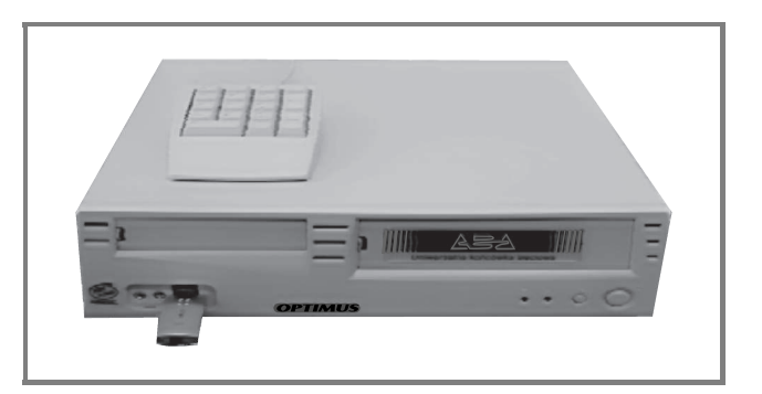
Fig. 3. The Optimus ABA IPSec Gate.

The Optimus ABA IPSec Gate is based on a specially minimized and hardened Linux operating system with implementation of IPsec standards named FreeS/Wan. All software is stored on flash RAM with manipulation protection. Moreover the software integrity is checked during the system start up, and in small regular time periods.