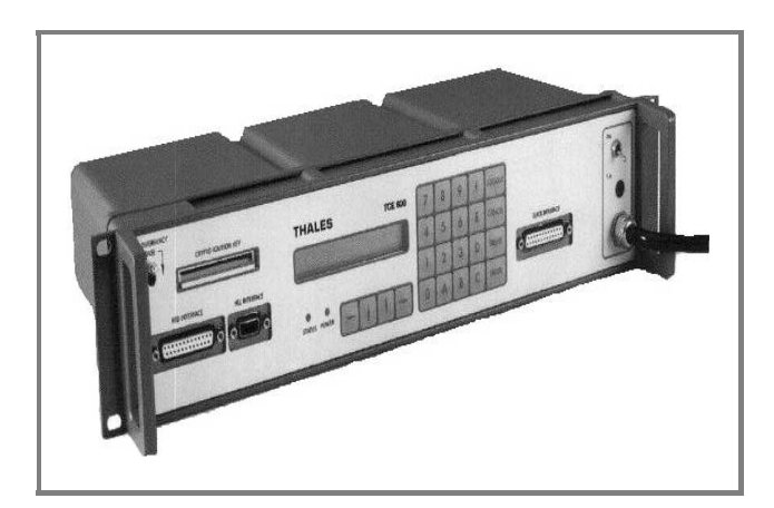
Fig. 2. The TCE 621 IP Crypto Device.

facturers. One of such approach is the TCE 621 IP Crypto Device (Fig. 2) developed by THALES Communications company which was approved for securing NATO IP networks.