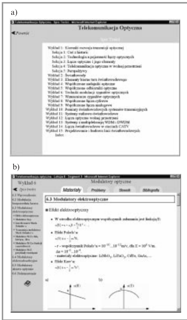
Fig. 2. (a) Table of contents. (b) Lecture material.

800 × 600 points and they will work in a full-screen mode to acquire materials. The result of the assumption is to assume that the essential content will be presented in a very small degree in a format of 600 × 500 points. These assumptions are reflected on the organisation of presented material.